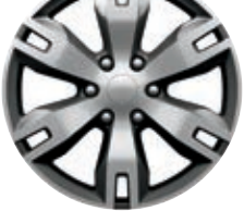
20" 6-Spoke Alloy Standard on LIMITED