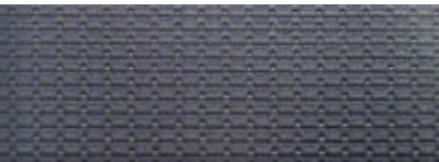
1 Ebony Cloth