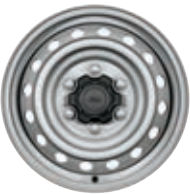
17" Silver-Painted Steel Standard on XLS