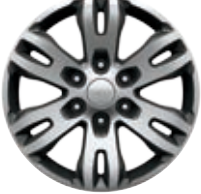
18" 6-Spoke Alloy Standard on XLT